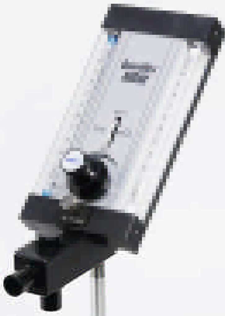
Part # 583S