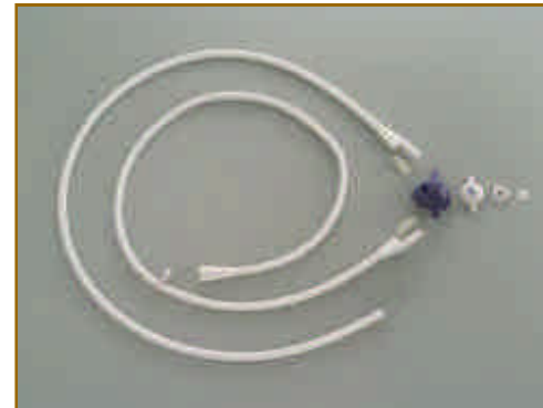
Matrix Scavenger only 8 parts to assemble

* Australian and New Zealand College of Anaesthetists